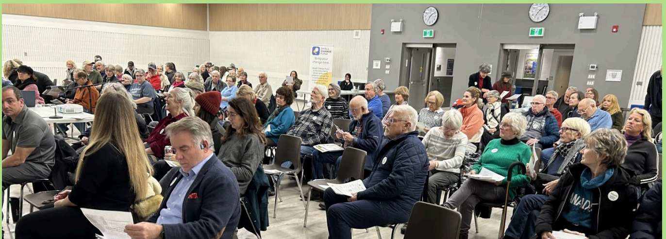
Attendees arriving on December 11th.

You'll receive a thank you email with links to share your letter on Facebook or your preferred social media.