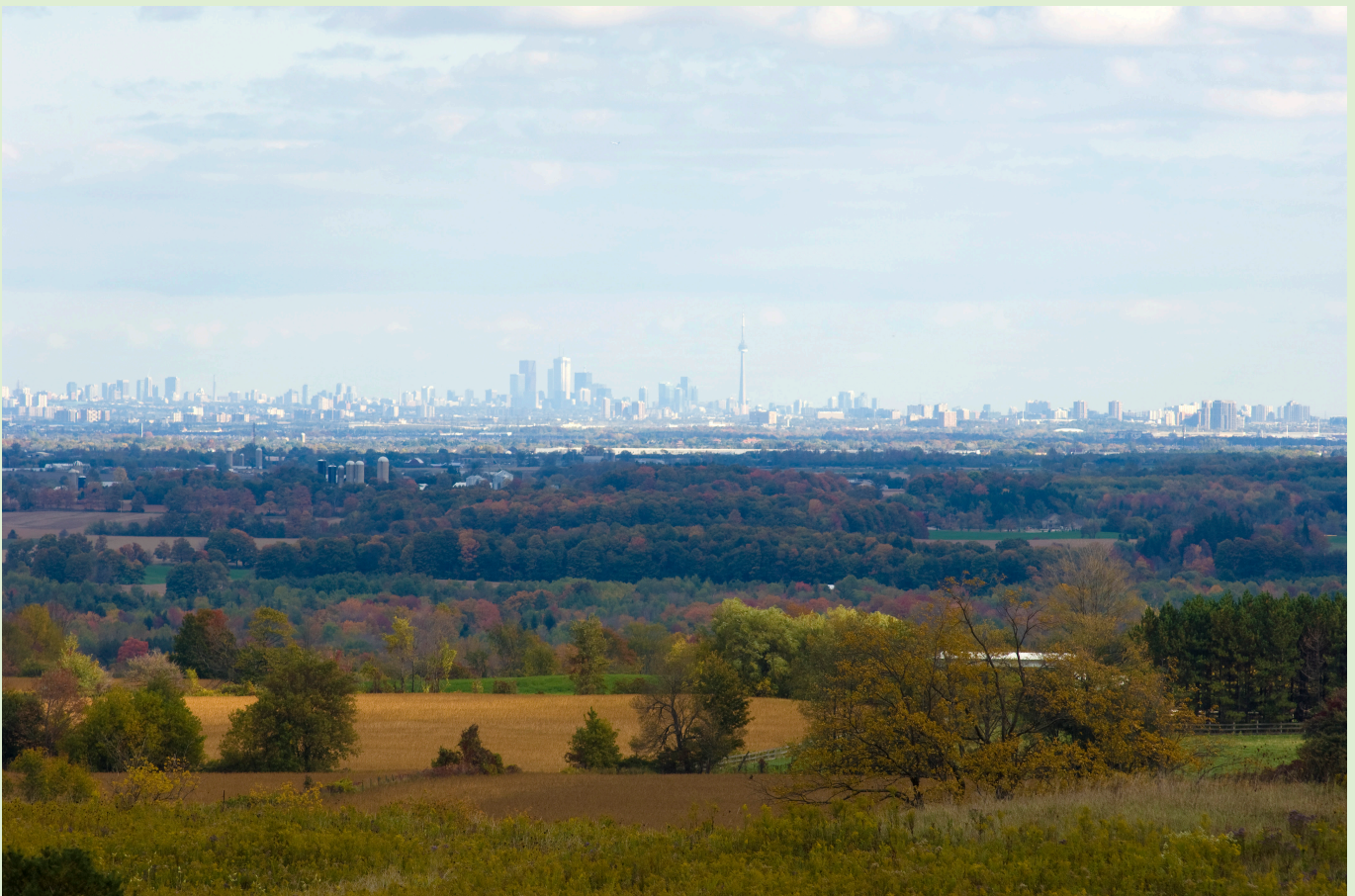
A view of the Peel Plain, valuable farmland.